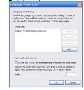
Figure 1: Language Preference

Go to Tools, Internet Options, click on the Languages button and then choose only the specified language(s) for your locale.